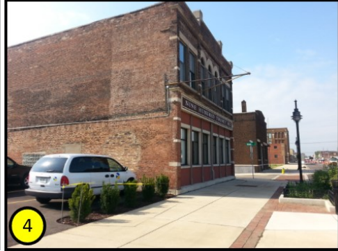
2: Pierson's Mattress – 1032 S. Western, 4: Tobin Building – 926 SW. Adams